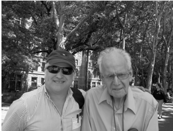
Fig. 1. Robert Carneiro with the author of the Obituary Richard Chacon outside the American Museum of Natural History in New York City.

Carneiro's success as museum Curator cannot be overemphasized. He spearheaded the remodeling of the Amazonian Indian Exhibit in the Hall of Native South American Peoples of the AMNH. Today, this exhibit, which was completed in 1989, exposes the general public to the cultural richness of South American native peoples. Carneiro saw to it that the beliefs and material culture of Indigenous peoples were accurately and respectfully represented in the museum's displays (see Carneiro 2019). Without a doubt, the Amazonian Indian Exhibit is a testimonial to Carneiro's vast ethnographic knowledge of the region and of the profound respect that he held for the Indigenous peoples of Amazonia.